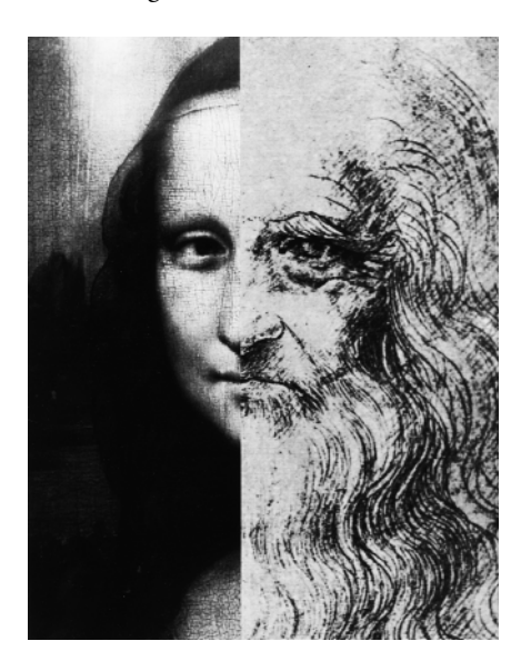
Fig. 2. Mona/Leo , a 1987 computergenerated image by Lillian F. Schwartz in which the left side of a 1512 Leonardo da Vinci self-portrait is matched to the right side of Mona Lisa's face.

Where Duchamp put the Mona Lisa's sexuality under tension, mocking the female icon without wholly undoing the gender identity between image and (presumed) model, Schwartz appears to explode it. Image and model simultaneously merge (two aspects of a single human being) and separate (male model, female image). This doubleness is epitomized in Schwartz's Mona/Leo (also known, in an early working title, as It Is I; Fig. 2), a 1987 image that shows the right half of Mona Lisa's face butted up to the left half of Leonardo's self-portrait [10]. Although Mona/Leo appears to be an artwork (at least, Schwartz treats it as such), I feel it is a kind of metonymy for the primary artwork, which is to say, Schwartz's demonstration of the identity of Mona Lisa and Leonardo. For the sake of simplicity in the following discussion, I will refer to this entire project, including both the discovery and the images Schwartz generated to demonstrate her