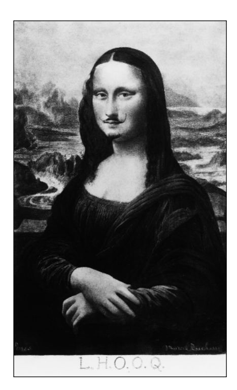
Fig. 1. Detail of L.H.O.O.Q. , a 1919 work by Marcel Duchamp that is an altered collotype of the Mona Lisa. (Courtesy of the Philadelphia Museum of Fine Art, Louise and Walter Arensberg Collection; © Succession Marcel Duchamp)

any discussion of L.H.O.O.Q. can take off in many other directions is a tribute to the richness of Duchamp's gesture, minimal as to form but maximal as to content [6]. Not the least of Duchamp's achievements with L.H.O.O.Q. was to bring the Mona Lisa back from the dead. By attacking its iconic status, he removed it from historical time and brought it into the present, the only place where art can be experienced. L.H.O.O.Q. was actually an act of rescue (even if only temporarily) rather than an act of desecration. However, it did not rescue the Mona Lisa as a traditional painting, an object of primarily visual pleasure. The crude mustache functions as a scratch on the Renaissance picture window; it insistently draws our attention to itself and thus irreparably damages the illusion of which it fails to be a part.