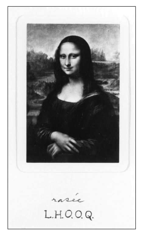
Fig. 4. Detail of L.H.O.O.Q. rasée (L.H.O.O.Q. Shaved), a readymade by Marcel Duchamp that is a playing card of Leonardo's Mona Lisa mounted on paper. In reproduction, as here, the only visible difference between the two works is the title and signature (here cropped out).

These retroactive transformations (L.H.O.O.Q. rasée acting on the Mona Lisa, Mona/Leo acting on L.H.O.O.Q. and Mona Lisa, and so on) are absorbing in part because they are historically contrary. The line of influence in art history is supposed to move temporally forwards, such